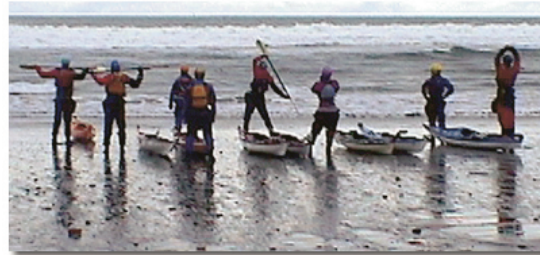
Stretching before surfing at La Push, WA

Certification is not a rubber stamp; it is earned through hard work on your part. With great modelling, teaching, knowledge, comfort on the water and three consecutive rolls, an ACA certification is a feather in your cap!