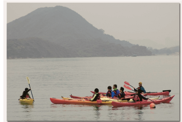
Teaching in Hong Kong Province

Private Lessons Team Building Group Rates Available