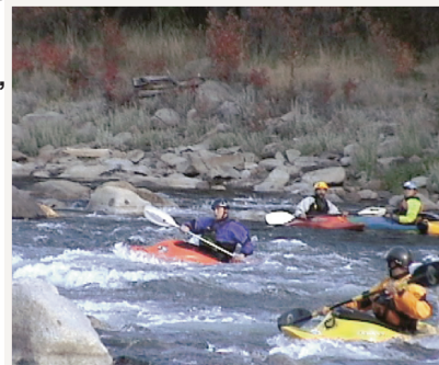
Ferrying on the Spokane River

Private Lessons Team Building Group Rates Available